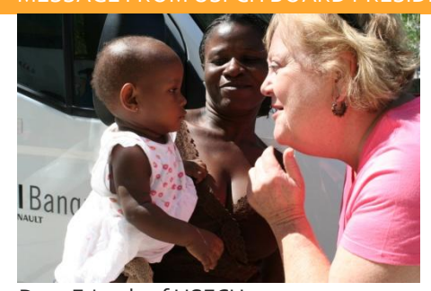
Dear Friends of USFCH,

It is my honor to work alongside several other dedicated board members to serve USFCH. We have been watching this amazing vision unfold for 31 years now and we've seen God do some amazing things!